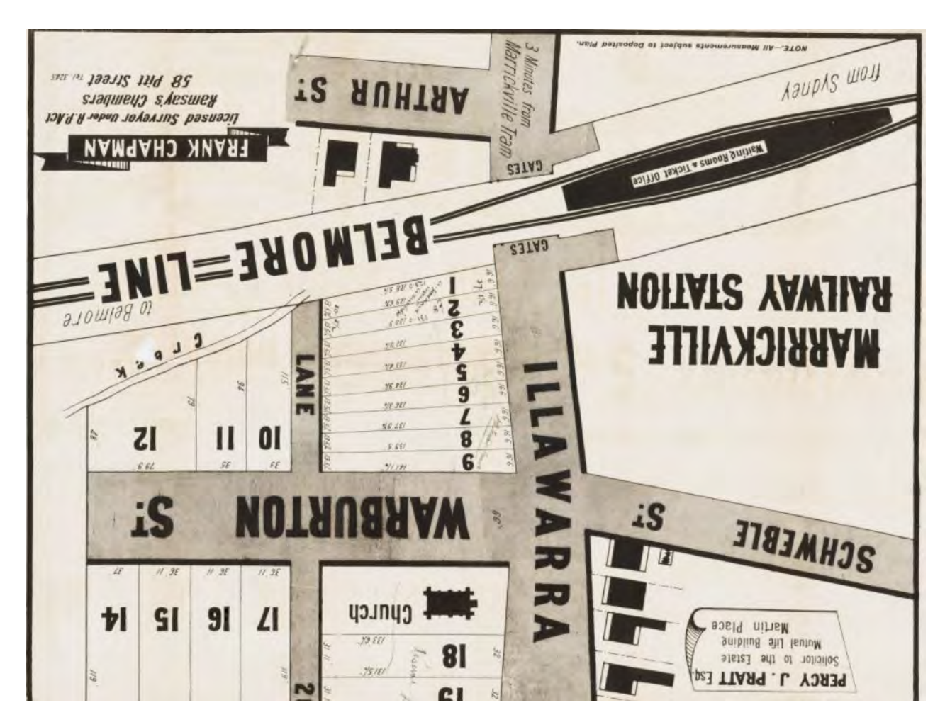
Plate 4.2 Detail of 1907 Marrickville Station Estate subdivision advertisement- Arthur St, Illawarra Rd, Schweble St, Warburton St, Greenbank St.