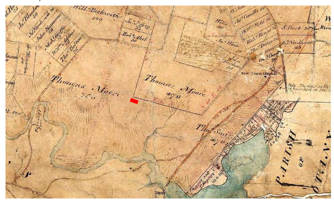
Plate 4.1 Detail of undated Parish of Petersham County of Cumberland plan, possibly dating to around 1850. The approximate location of the project area is marked in red