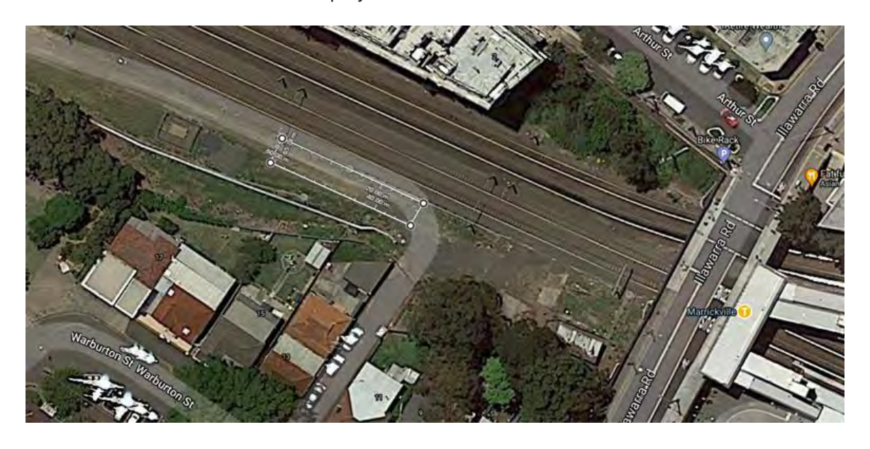
Plate 2.1 Project area

Wooley Lane is located directly northwest of Marrickville Station, Marrickville, in the Parish of Petersham, County of Cumberland and sits within the Inner West local government area. The project area is bounded by rail corridor to the north, Illawarra Road to the east, McNeilly Park to the west, and residential housing along Warburton Street to the south. The project area is shown in Plate 2.1 below.